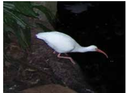
White ibis.

Colonial waterbirds serve as indicators of habitat suitability (Gawlik, Slack, Thomas, & Harpole, 1998), which is one reason it is important to study native wading birds at Disney's Animal Kingdom®. The American white ibis ( Eudocimus albus ), in particular, has become a symbol for wetland conservation and restoration (Kushlan & Bildstein, 2009). Large flocks of white wading birds are an indicator to visitors that they have arrived in Florida. Ibis are gregarious and roost together, usually in the tops of dead trees, and often are found in close proximity to other wading birds like great egrets