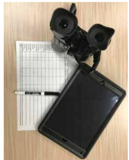
Guest interaction supplies.

white and golden feathers and I like that they are often found in proximity to bovids, which is my other favorite group of animals. The study site has changed locations a few times. After the Pandora construction was complete, the majority of the birds moved back to the original roost site for a short time. Due to visibility issues, two keepers were needed for each study time frame. The best visibility for this location was on the two bridges going into the Oasis area and Pandora but each only afforded a view of half the roosting area.