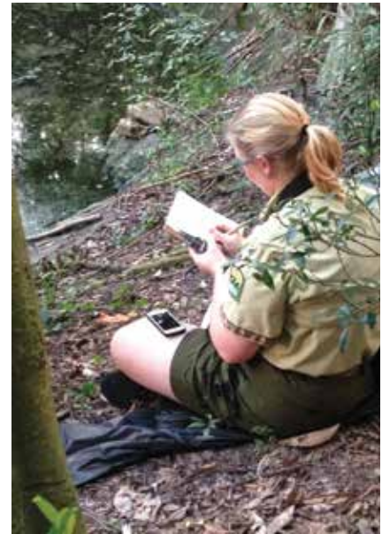
Researcher in action.

Twice a month (15 th and 30 th ), one or more keepers heads to the canal to record the current roost population of ibis and great egrets. The study time starts at 30 minutes before sunset and ends at 15 minutes post-sunset. We include any birds already roosted when we arrive then add in all those who fly in. I was trained on bird identification and study protocols by a member of the Conservation team. I then facilitated the training of the other researchers using a bird identification PowerPoint, practice studies, and direct observation. We focus specifically on white ibis, great egrets, and little blue herons but record all avian species. We occasionally see anhingas, hawks, owls, ducks, cattle egrets, green herons, and snowy egrets. Many of the zookeepers have a favorite among the rarer species; mine is the cattle egret. I am drawn to the mix of